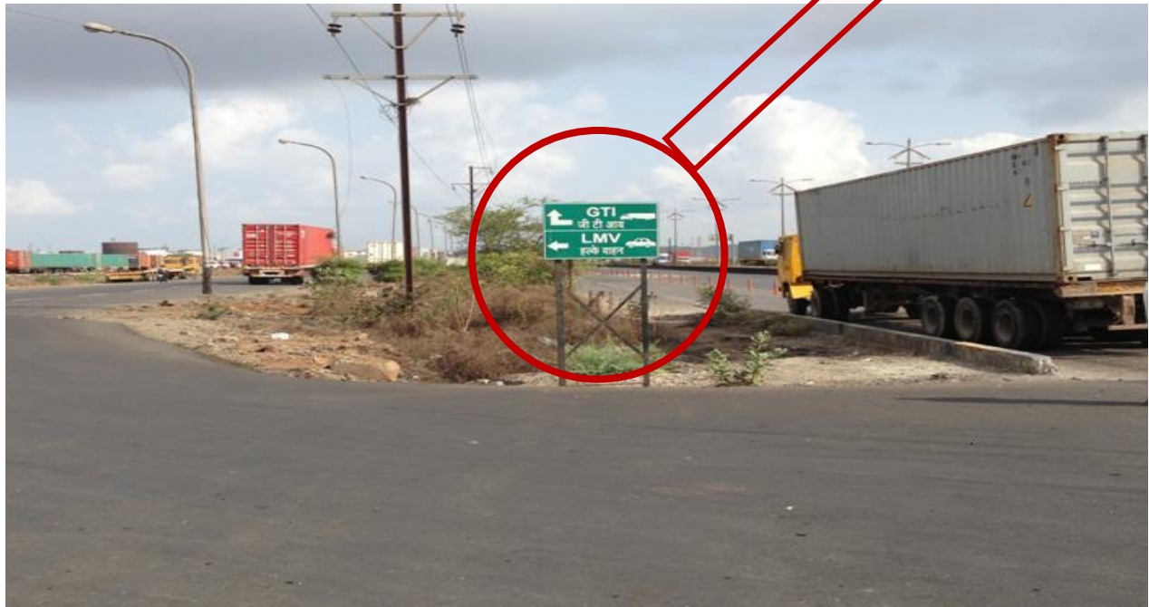
Dedicated approach road for APM Terminals Mumbai (GTI)